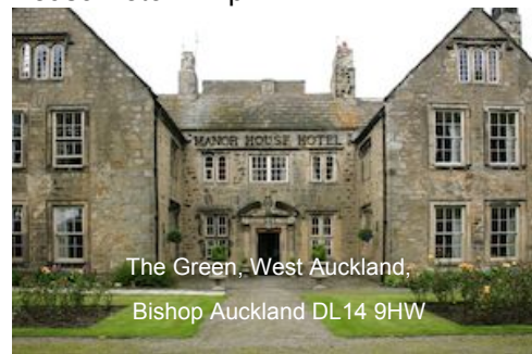
The Green, West Auckland, Bishop Auckland DL14 9HW

This excellent meeting finally closed with many friendships renewed and an invitation to meet again at the Manor House Hotel in April.