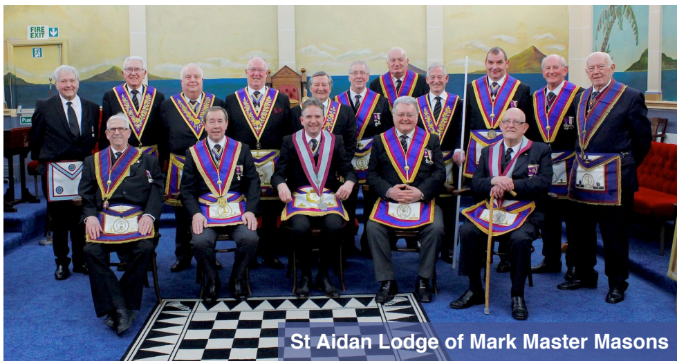
St Aidan Lodge of Mark Master Masons