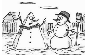
"I was built by a Freemason!"

Brethren can support the Durham 2020 Festival by purchasing this special badge which can be supplied by