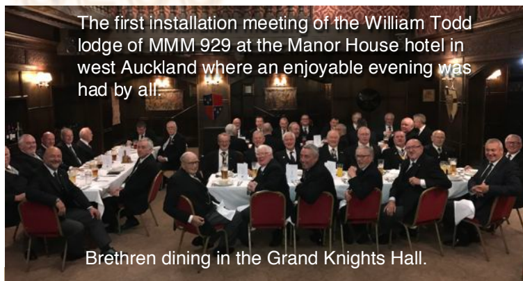
The first installation meeting of the William Todd lodge of MMM 929 at the Manor House hotel in west Auckland where an enjoyable evening was had by all.