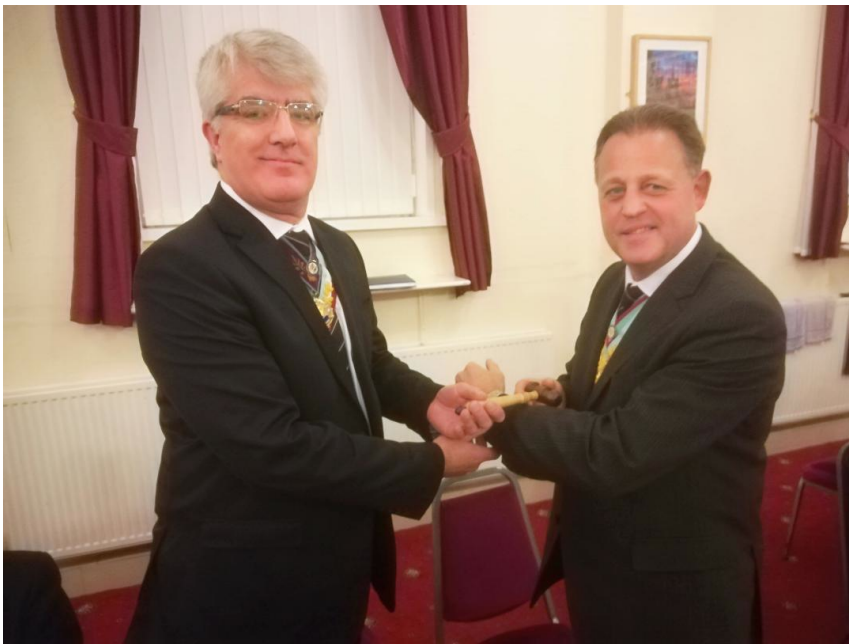
Congratulations to Cestria Lodge No.1151