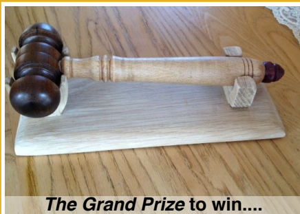
The Grand Prize to win....