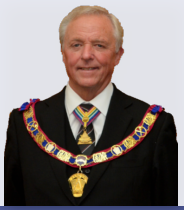
PGM of DURHAM

PROVINCIAL GRAND LODGE OF MARK MASTER MASONS AND ROYAL ARK MARINERS OF DURHAM