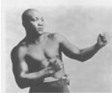
Jack Johnson 1878 - 1946

The talk entitled "Scottish Freemasonry and the Black Boxer "