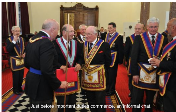
Just before important duties commence, an informal chat.