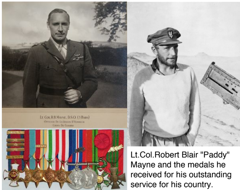
Lt.Col. Robert Blair "Paddy" Mayne and the medals he received for his outstanding service for his country.

The brethren showed their appreciation with enthusiastic applause.