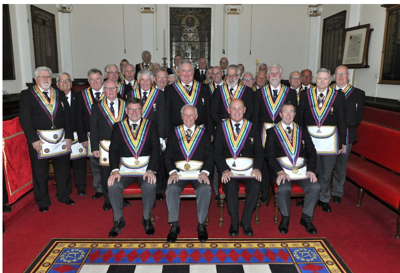
ROCKCLIFFE LODGE OF ROYAL ARK MARINERS NO. 362