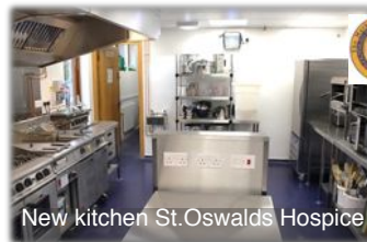
New kitchen St.Oswalds Hospice

In 2016, the kitchen at St Oswald’s Hospice was old and tired. After 30 years of near constant use, preparing meals for hospice patients, visitors, volunteers and staff, the equipment was constantly breaking down. The tiled walls and floors were cracked in places and very difficult to keep clean.