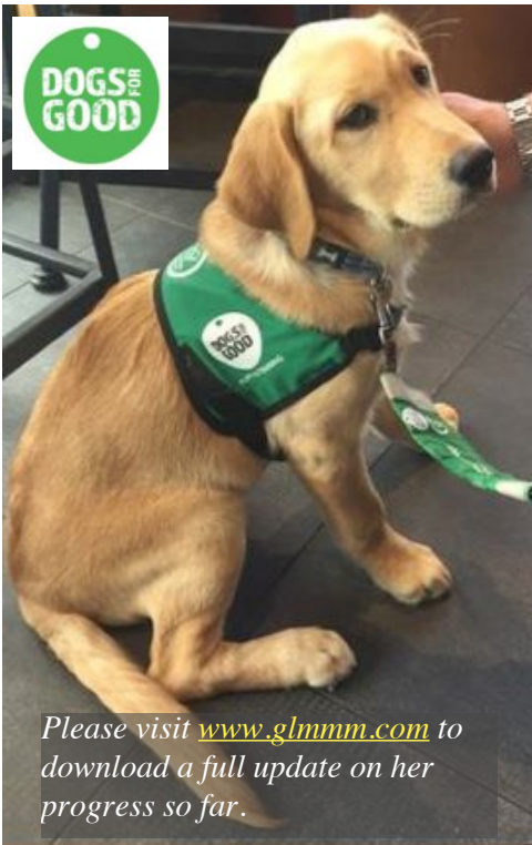
Please visit www.glmnm.com to download a full update on her progress so far.