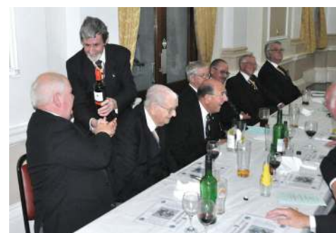
A wonderful festive board atmosphere with many brethren prize winners and enjoying this special centenary evening.

The Brethren retired to the dining hall and enjoyed the festive board where the usual masonic toasts were observed and it was hoped another one hundred years of wonderful Masonic Fraternal friendships would continue in similar excellence.