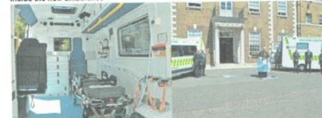
The Dean dedicates the new vehicles