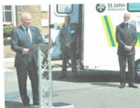
The Prior at the Mark Master Masons handover event 19 July 2017

Monday 17 July saw the official dedication and handover of the first two vehicles given by the Mark Master Masons to St John Ambulance.