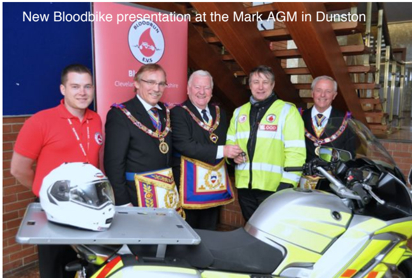
New Bloodbike presentation at the Mark AGM in Dunston