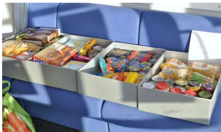
Prepared parcels ready for distribution

to the Mark Degree and they both gave a brief account of how they work closely with other agencies to identify families in most need. It was a delight for the presentation team to make this grant which was both rewarding and could be seen to make a real difference for many individuals in the community.