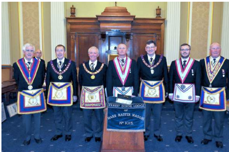
ERNEST DIXON LODGE OF MMM NO. 1015