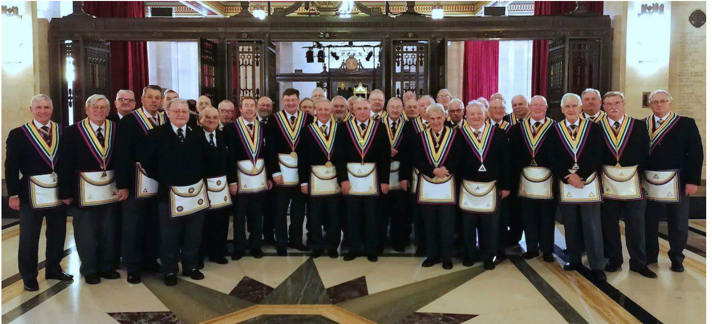
The Province of Durham was once again well represented in London when 37 Royal Ark Mariner Brethren travelled to the Great Queen Street Temple together with the Provincial Grand Master to support those brethren receiving Grand Rank in the Ancient and Honourable Fraternity of Royal Ark Mariner from the Pro Grand Master.