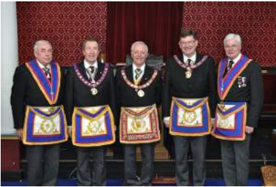
The Main Characters

Hackworth Lodge of Mark Master Masons hosted their Christmas Party on their regular meeting at the beginning of December. The meeting was to see the Provincial Grand Master and a Deputation of Provincial Officers also attend. This would make the evening even more special to the Lodge and its visitors.