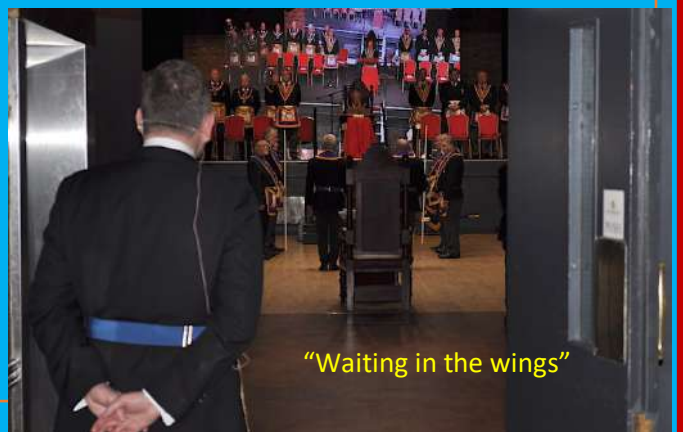
"Waiting in the wings"