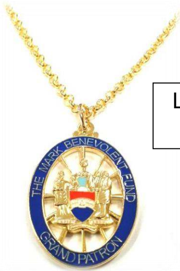
Ladies Grand Patron worn as a Pendant