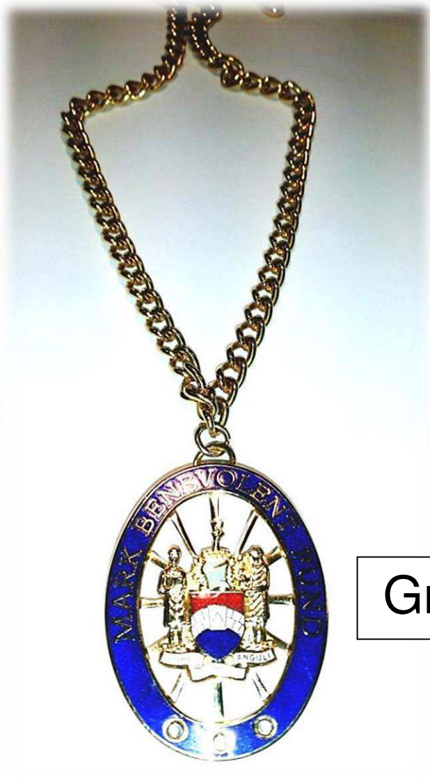
Grand Patron Diamond