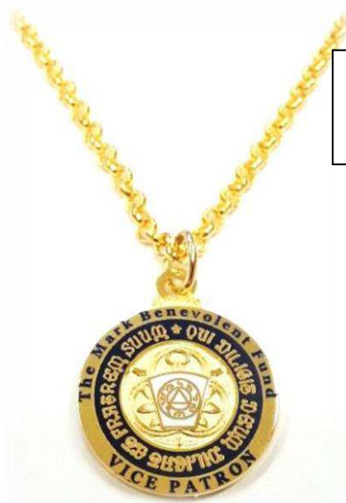
Ladies Vice-Patron worn as a Pendant