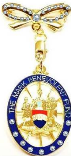
Ladies Grand Patron Diamond