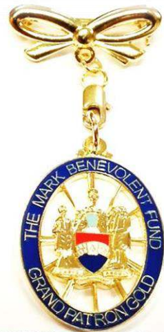
Ladies Grand Patron Gold worn as a Brooch